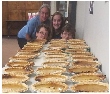
From previous years.

Pumpkin Pie Fundraiser. The pies will be $12 each (gluten free and/or non dairy options too). The pathfinders have been taking orders. If you haven't been contacted by <u>the 20th</u>, please reach out to me. All funds raised will go to the International Camporee trip. Twyla, luke@olypen.com; 360-461-0394.