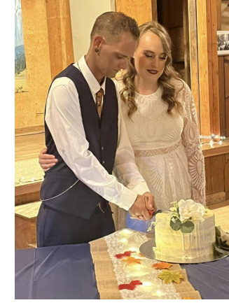
The small ceremony was held in Port Angeles amongst family.